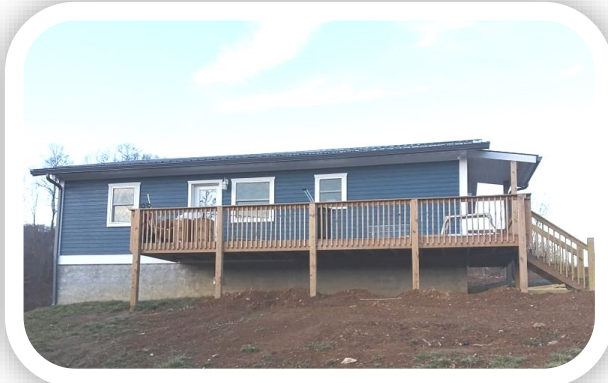
The Clark House in White Oak Knoll