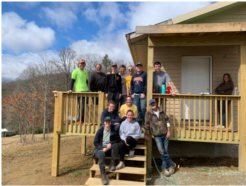
ISU & OSU on the porch of Build 52 (P Clark)

OUR INTERNATIONAL FAMILIES SERVED TOTAL HAS REACHED 47 FAMILIES THROUGH OUR TITHE. IN ADDITION TO THE 51 HOUSES WE HAVE COMPLETED, WITH 52 & 53 NEARING COMPLETION, THAT MEANS AVERY COUNTY HABITAT FOR HUMANITY HAS HELPED BUILD 100 HOUSING UNITS IN NC AND GUATEMALA! THANK YOU FOR YOUR SUPPORT IN THIS ENDEAVOR!