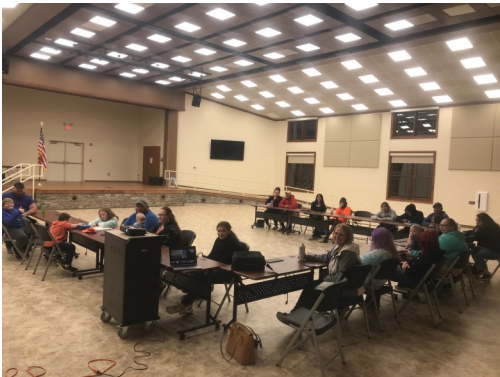
Partner Family Education Program

Earlier this year the Avery County Community Room was filled with 8 Partner Families working toward their Financial Education program requirement and Sweat Equity to start construction on their home. Our pipeline of families is strong! We appreciate the partnership with Mayland Community College and the county!