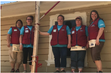
Lowe's Red Vests and Heroes volunteering on a previous build. We value our partnership with Lowe's!

OUR INTERNATIONAL FAMILIES SERVED TOTAL HAS REACHED 47 FAMILIES THROUGH OUR TITHE. IN ADDITION TO THE 51 HOUSES WE HAVE COMPLETED, WITH 52 & 53 NEARING COMPLETION, THAT MEANS AVERY COUNTY HABITAT FOR HUMANITY HAS HELPED BUILD 100 HOUSING UNITS IN NC AND GUATEMALA! THANK YOU FOR YOUR SUPPORT IN THIS ENDEAVOR!